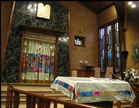
Bnai Torah Longmeadow

In 2024 we are creating a new one employing a different technique.