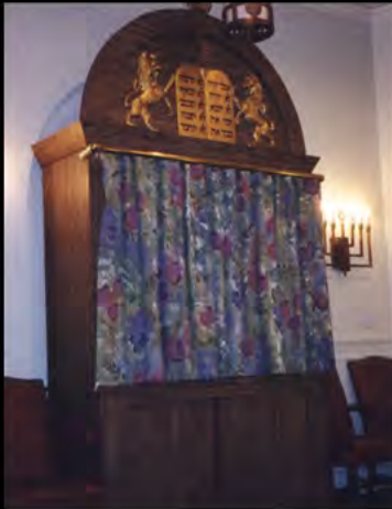
Sha'arei Zedeck Clinton

Ark curtains have been made both independently or collaboratively* since 1986.