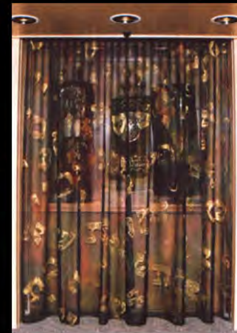
Congregation Beth Shalom The Woodlands