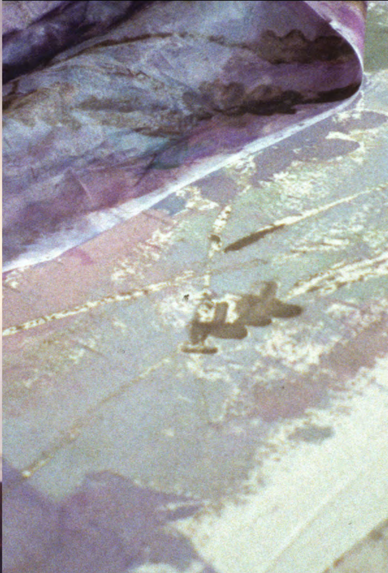
Congregation Sha'arei Zedeck Clinton, MA