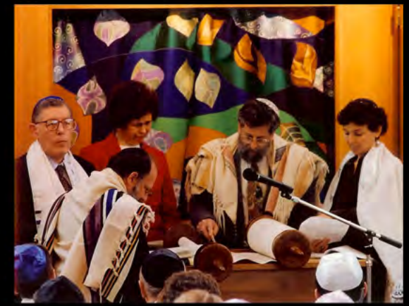
Dartmouth College Hanover