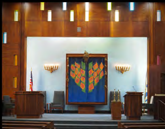
Temple Sinai Cranston