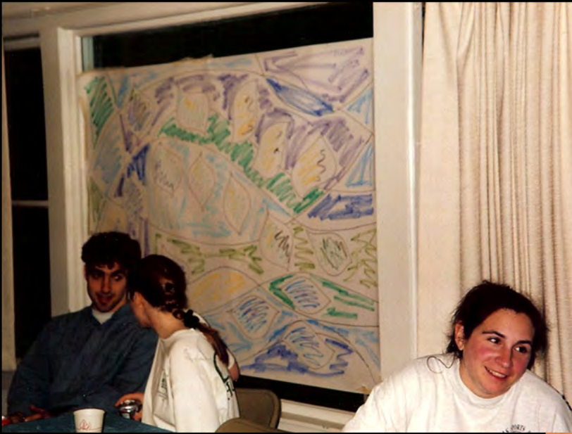
Roth Center for Jewish Life Dartmouth College Hanover, NH